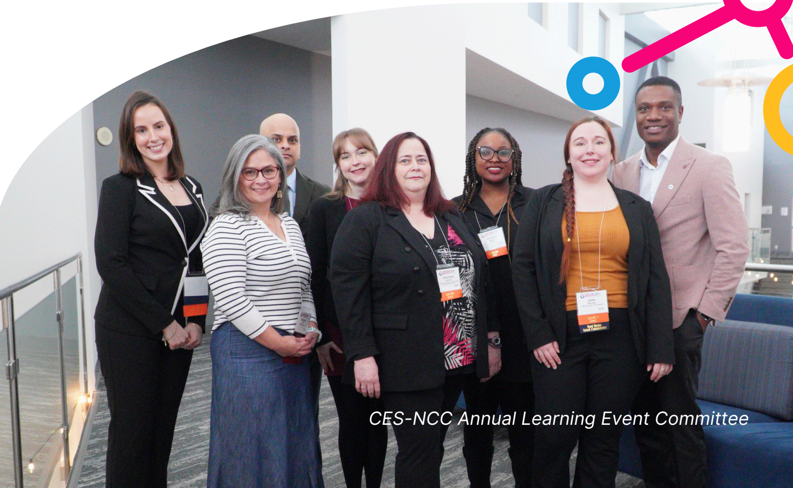
CES-NCC Annual Learning Event Committee